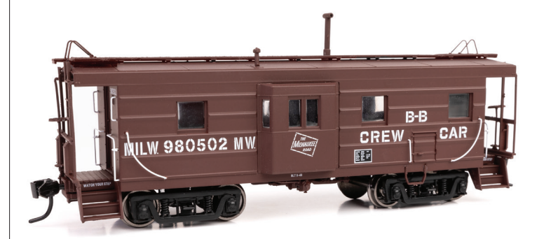
Buildings & Bridges Crew Car w/Oil Stove