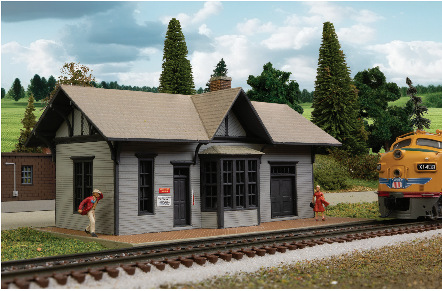
Figures, vehicles, railroad equipment, and scenery items not included.