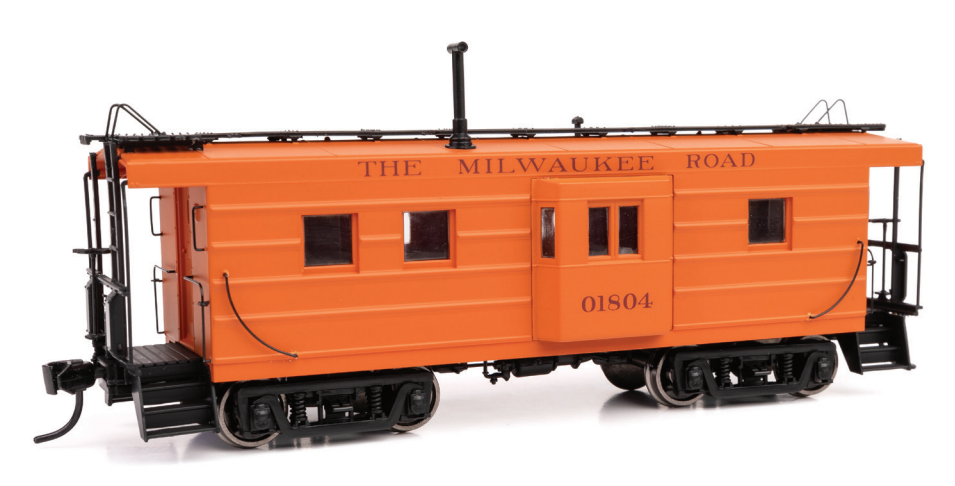
Orange & Maroon w/Coal Stove