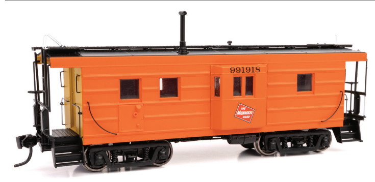
Orange, Black Roof, Yellow Ends w/Oil Stove