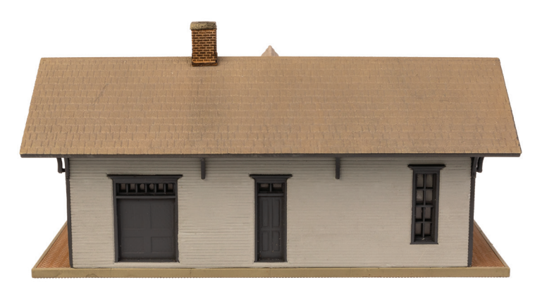
Golden Valley Depot