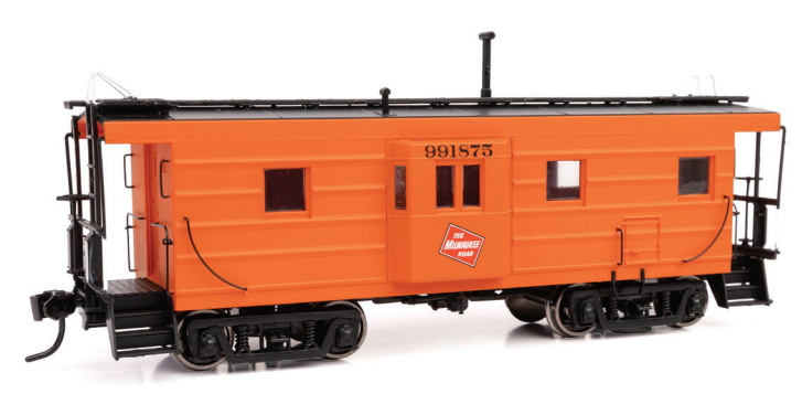
Orange, Black Roof w/Oil Stove