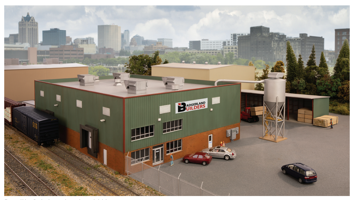
{\it Figures, vehicles, railroad\ equipment, and\ scenery\ items\ not\ included.}