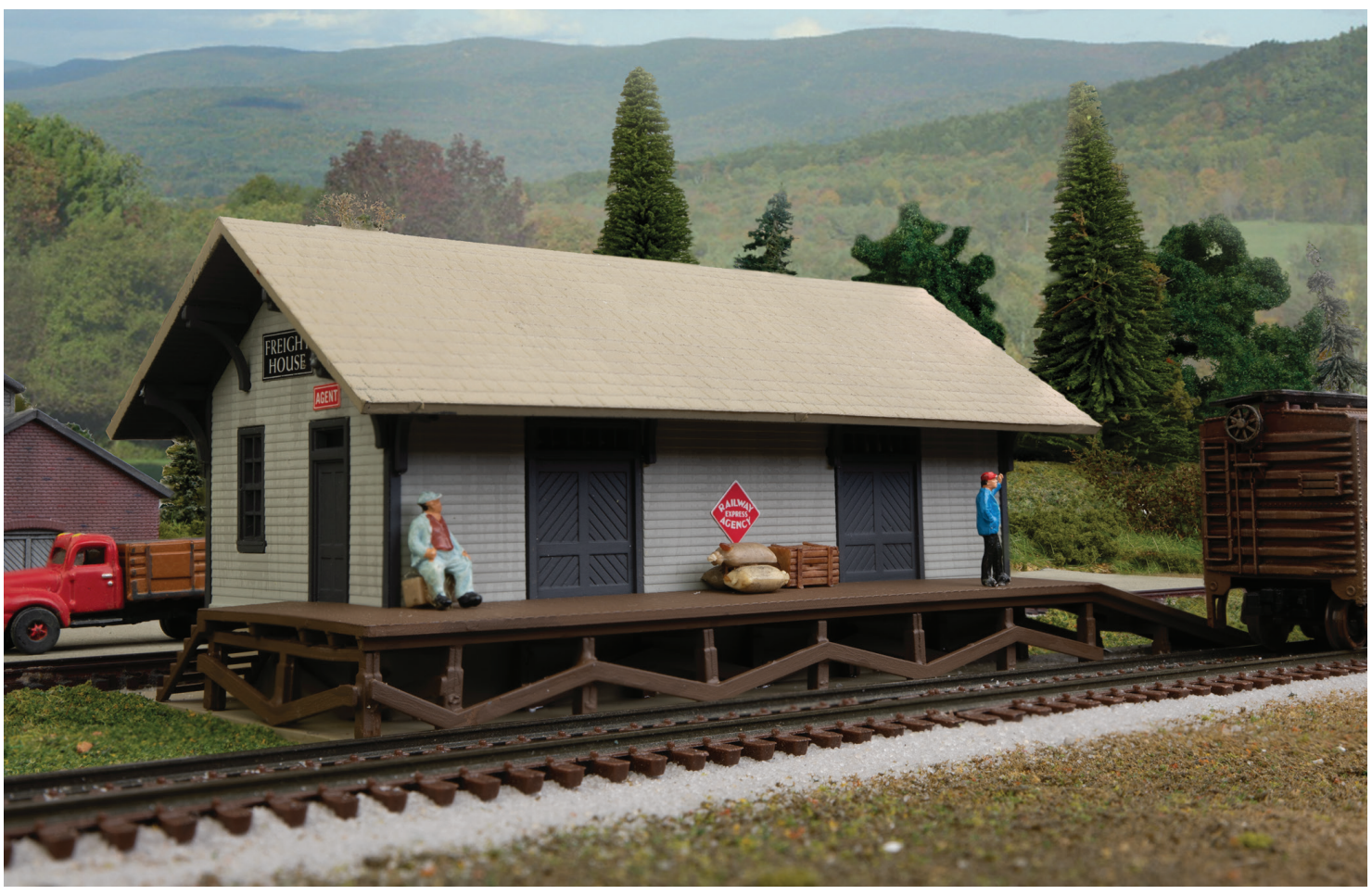
Figures, vehicles, railroad equipment, and scenery items not included.