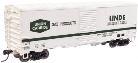
Linde Gas - LAPX 910-1208 #2014 910-1209 #2050 910-1210 #2052