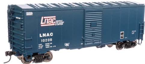
Louisville, New Albany & Corydon - LNAC 910-1211 #10208 910-1212 #10209 910-1213 #10254