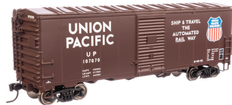
Union Pacific® 910-1214 #107070 910-1215 #107272 910-1216 #107448