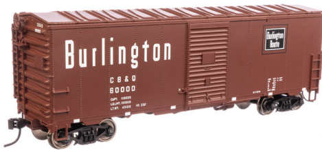
Chicago, Burlington & Quincy 910-1205 #60000 910-1206 #60785 910-1207 #61180