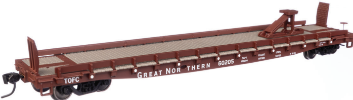
Great Northern 910-50504 #60205