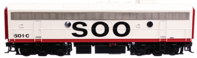
920-42554 #501A, #501C LokSound 5