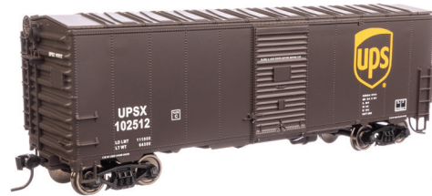
United Parcel Service® - UPS® 910-1217 #102512 910-1218 #102527 910-1219 #102534