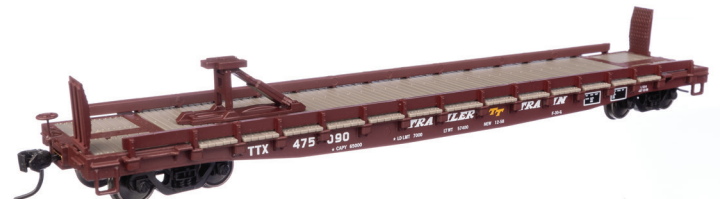
Trailer-Train 910-50513 #475090 910-50516 #475130