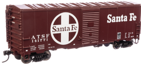
Santa Fe 910-1202 #141771 910-1203 #143820 910-1204 #144139