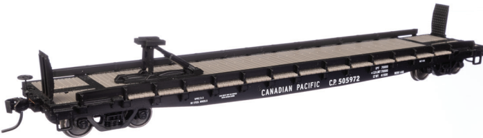
Canadian Pacific 910-50501 #505972