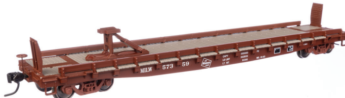
Milwaukee Road ††† 910-50507 #57359