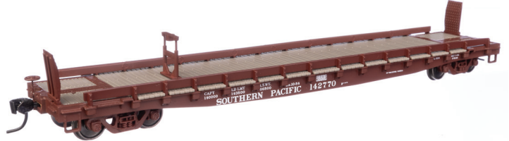
Southern Pacific † 910-50510 #142770